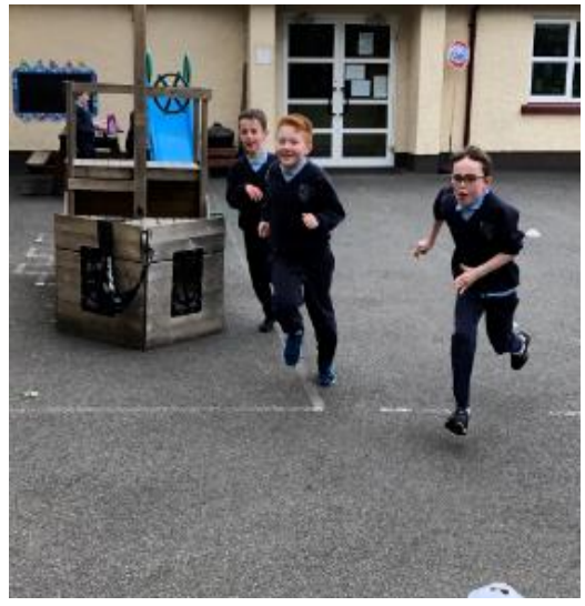
Cash 4 Clobber

Remember our Cash 4 Clobber will be collected on Monday 20^{th} May.